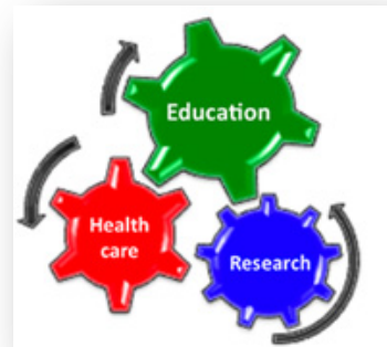
Monitoring, Evaluation and Development